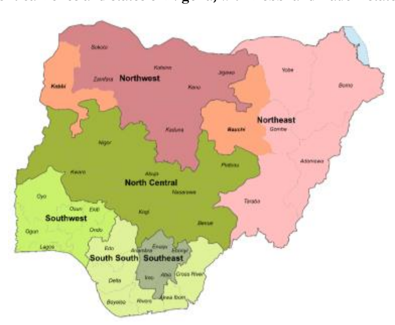
Figure 1. Map of geopolitical zones and states of Nigeria, with Kebbi and Bauchi states highlighted

Hausa/Fulani cultural area of northern Nigeria and southern Niger. Virtually all communities in the northern areas of the two states are Muslim, while more heterogeneity is seen in the southern part of both states, with Christian communities being common. Neither state has recently been directly attacked by the Boko Haram insurgents, who are centered in Borno state in the far northeast. Bauchi between 2009 and 2015 suffered insurgent attacks and inflows of internally displaced persons from other states in the Northeast. However, at the time of fieldwork in 2017 the security situation in Bauchi state was guardedly stable.